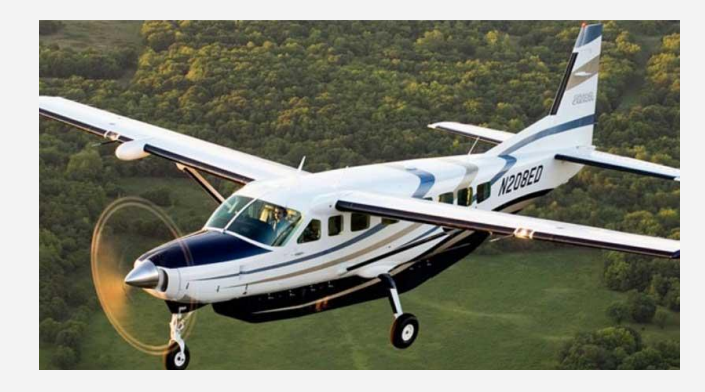
Both Buenos Aires flights will be aboard an 8 seat Cessna Grand Caravan EX.

This itinerary features 3 charter flights to get you quickly and conveniently to your destinations. The outbound flight from Buenos Aires will be directly to La Alondra Lodge. The return flight to Buenos Aires will depart from Itati Lodge.