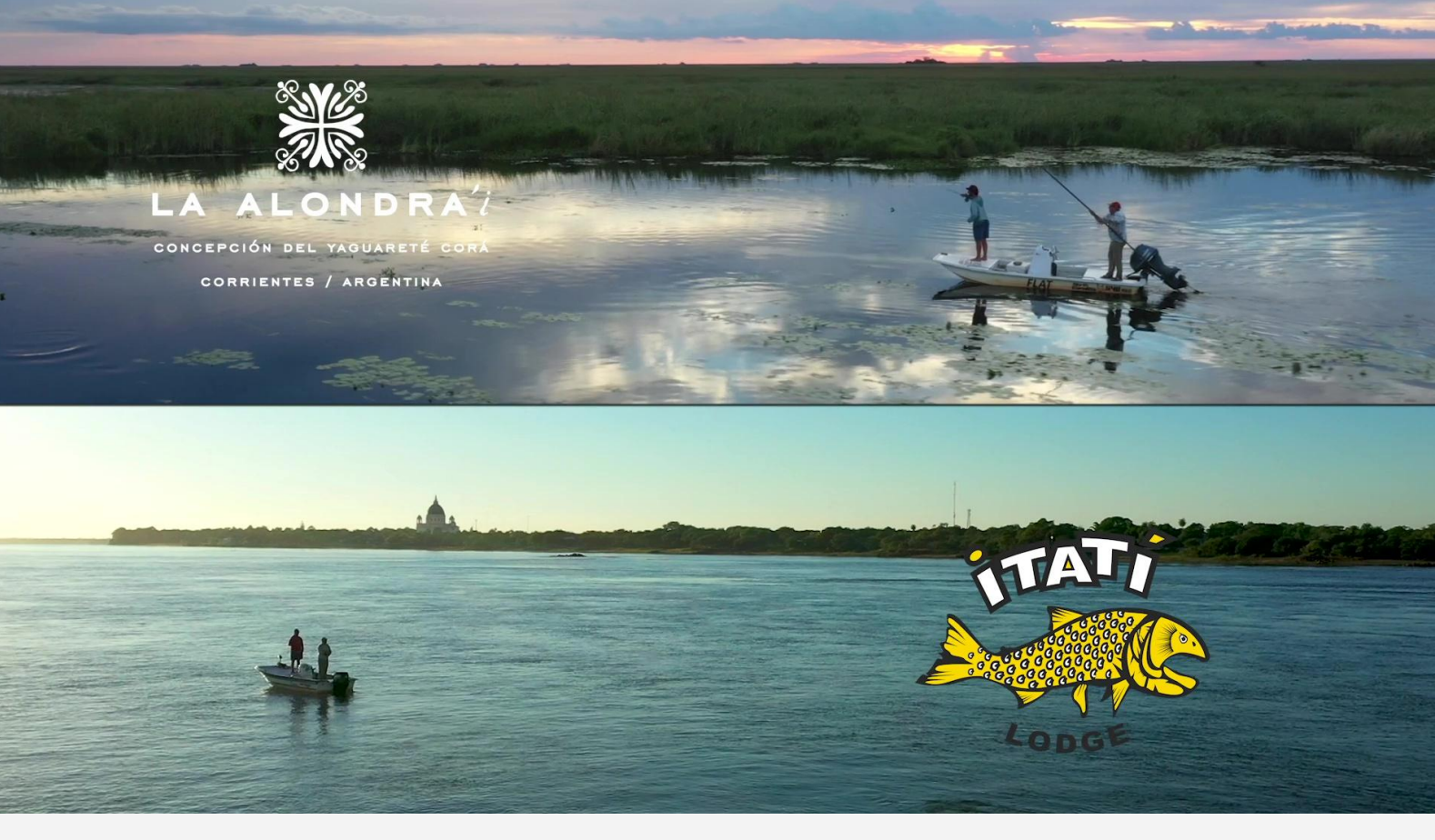
La Alondra 'i + The Itati Lodge Combo

Ibera Wetlands and Upper Parana River, North east Argentina