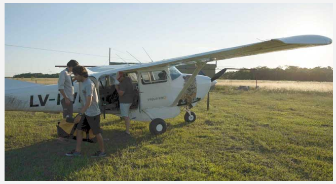
Flights between La Alondra Lodge and Itati Lodge will be aboard a 4 seat Cessna 206 aircraft. Two planes will be flown in order for the entire group to arrive at the same time.